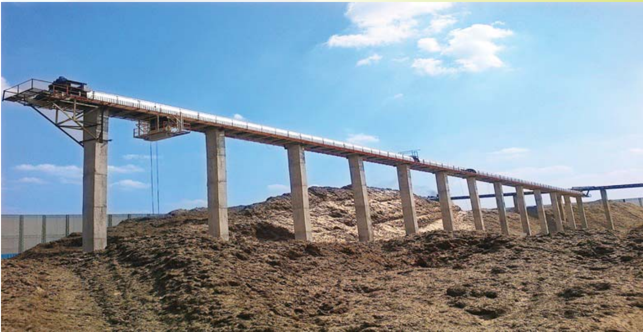
Conveyor Belt 1.8x152 m