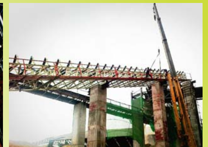
Conveyor Belt 2.0x76.50 m