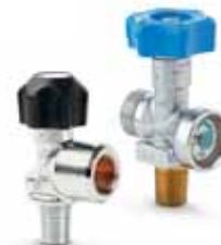
STANDARD VALVES WITH RPV