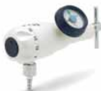
ALPINOX PIN INDEX