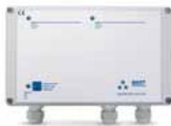
DATA MANAGEMENT SYSTEM