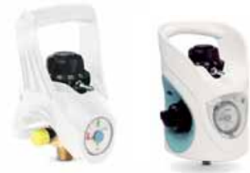
INTELLIGENT MANAGING SYSTEMS