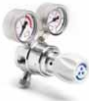
CARTRIDGE SINGLE STAGE