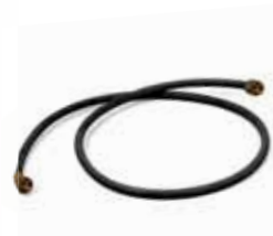
COMBO CLIM FOR HVAC APPLICATIONS