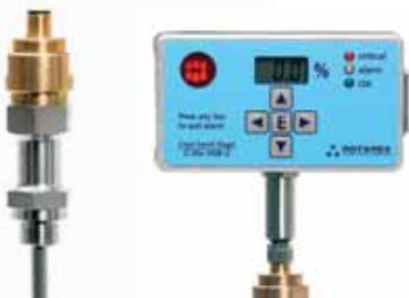
C-STIC CRYOGENIC DIGITAL MEASUREMENT SYSTEM