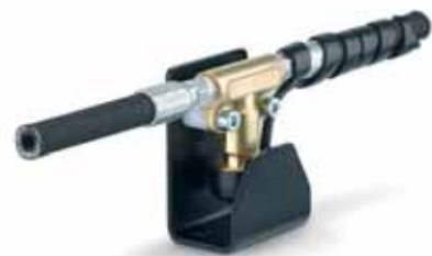
MLD MINIMUM LEVEL DETECTION SYSTEM

See all our digital solutions www.rotarex.com