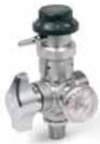
VALVES WITH FLOW REGULATOR INTEGRATED