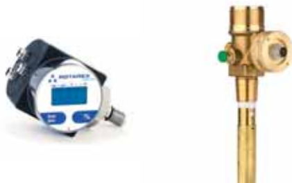
DIMES DIGITAL MEASUREMENT SYSTEM