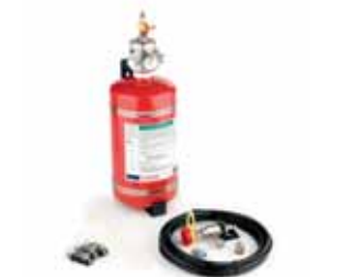
ABC DRY CHEMICAL

See all our Firedetec range www.rotarexfiretec.com