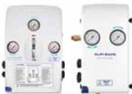
SWITCH OVER BOARDS AND SUPPLY BOARDS