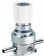
ULTRA HIGH PURITY