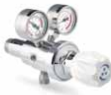
CARTRIDGE DUAL STAGE