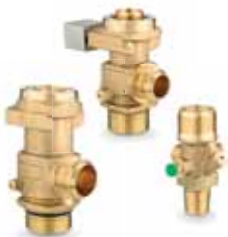
CYLINDERS / VALVES