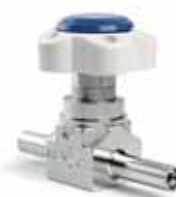
VALVE FOR CORROSIVE GAS