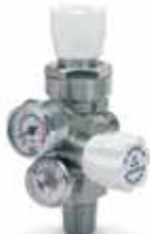
VALVES WITH PRESSURE REGULATOR INTEGRATED