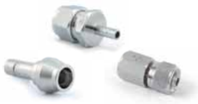
DOUBLE RING ADAPTORS