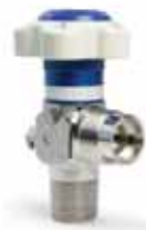
TON TANK VALVE