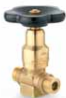
LINE AND ANGLE BUNDLE VALVE