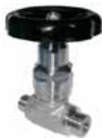
VALVE FOR INERT GAS