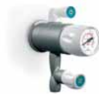
ULTRA COMPACT POINT OF USE FOR LABORATORY