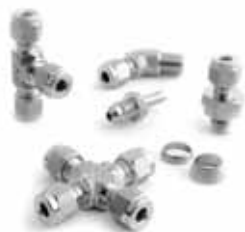
DOUBLE RING FITTINGS