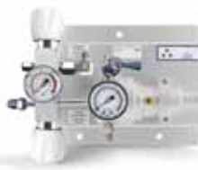
ULTRA HIGH PURITY