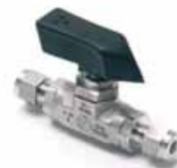
SERIES BV 302 - HP