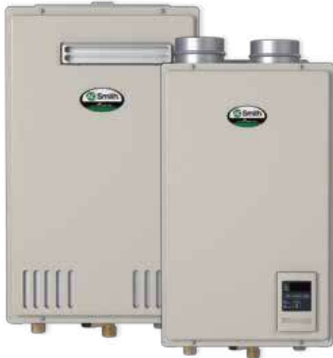
140 OUTDOOR MODEL 140 INDOOR MODEL