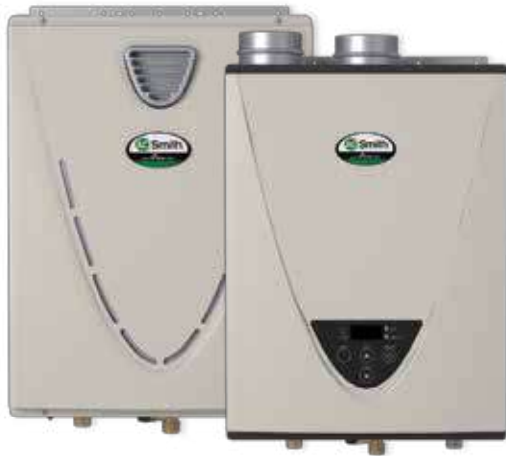
240 OUTDOOR MODEL 240 INDOOR MODEL