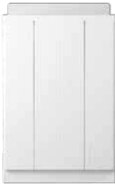
TABLE TOP MODEL