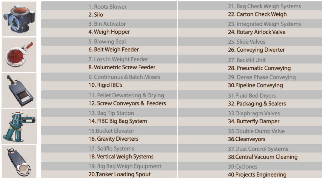
PRODUCT DRYING, STORAGE, WEIGHING & OUTLOADING 40