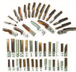
Pelletizing knives for plastic & polymer