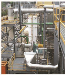
Vapour Recovery Units