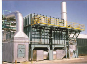
Regenerative & Catalytic Thermal Oxidizers