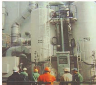
Carbon Adsorption Units