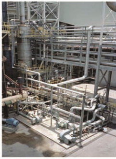
Direct Thermal Oxidizers