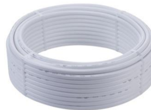
A/C pipe - white