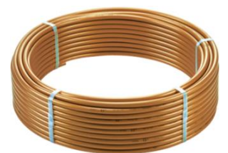
A/C pipe - gold