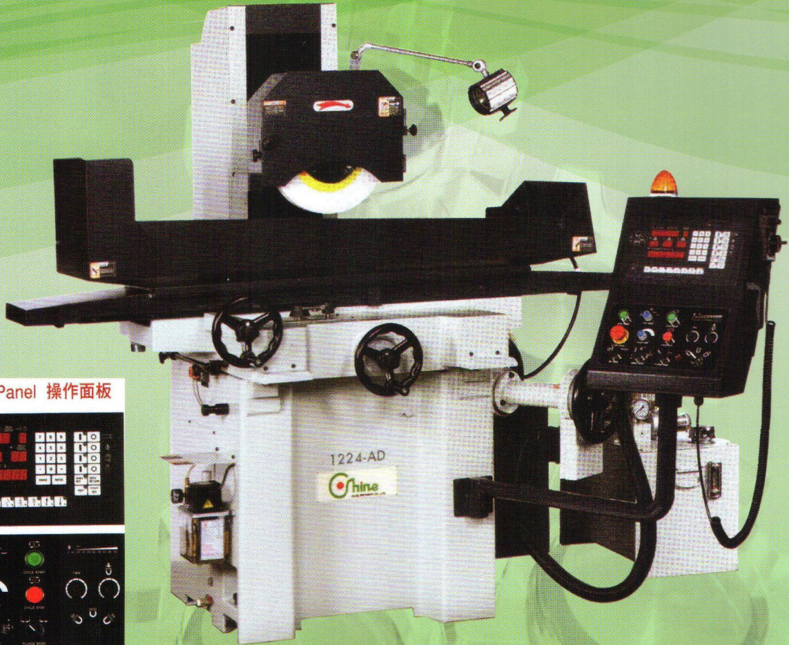
Operation Panel 操作面板