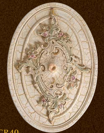
F-CR40 W967 X H678mm