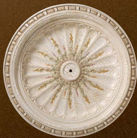
F-D9 Ø 1230 X D120mm