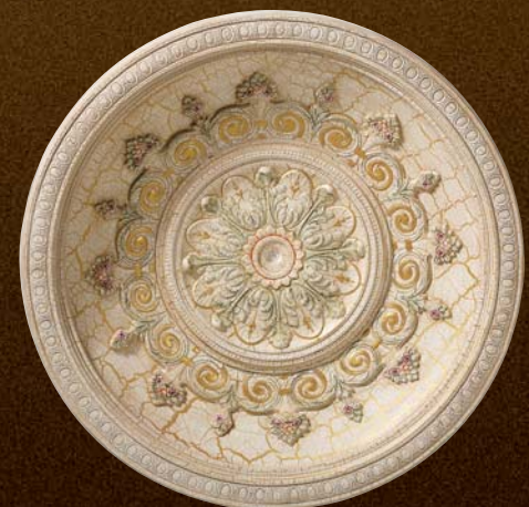
F-D12 Ø 1170 X D170mm