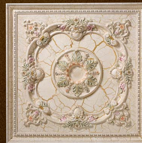
F-KD4 Ø 1200 X D90mm