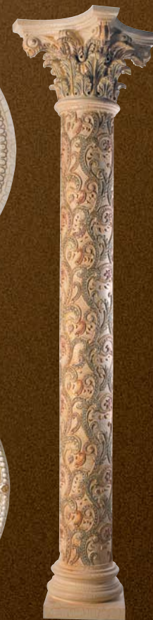
F-P1 H2190 X Ø260mm