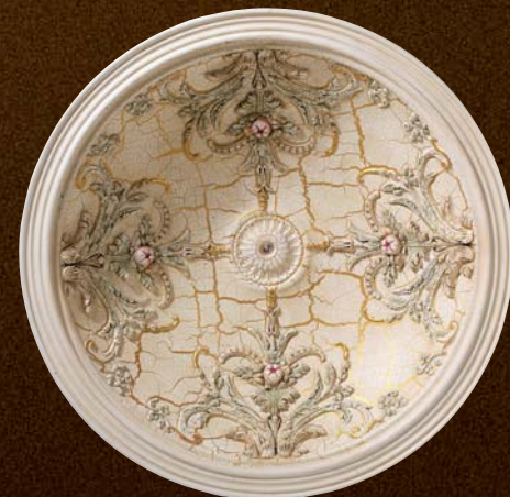
F-D13 Ø 1155 X D230mm