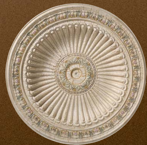
F-D8 Ø 1390 X D175mm