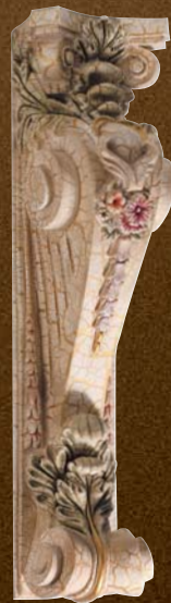
F-KB56 H730 X W200 X D200mm