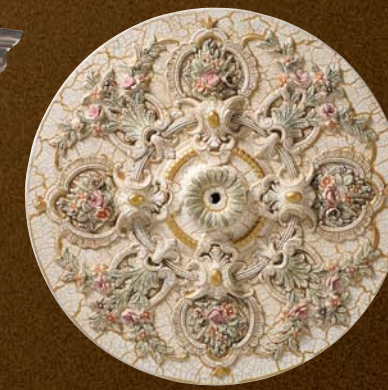
F-CR3 Ø 1150 | Ø 858mm