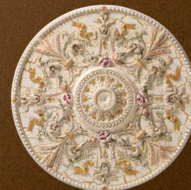
F-CR11 Ø 835mm