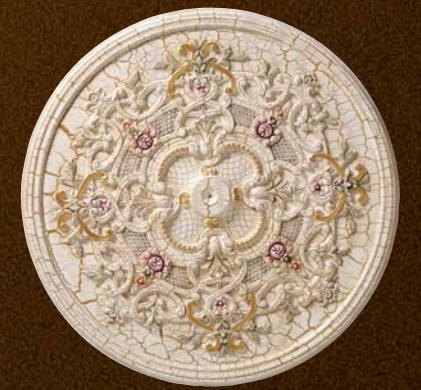
F-CR9 Ø 842mm