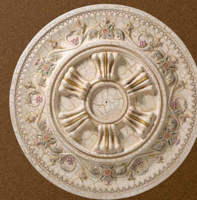
F-CR2 Ø 1130mm