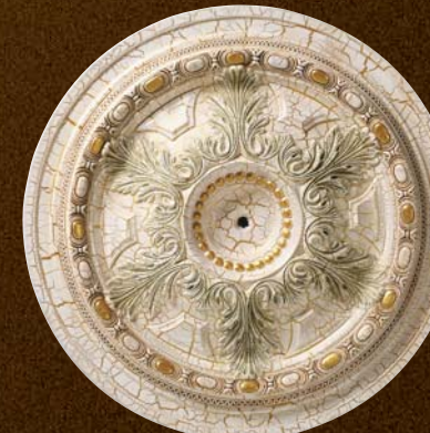
F-CR15 Ø 762mm