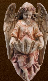
F-KB29 H500 X W280mm