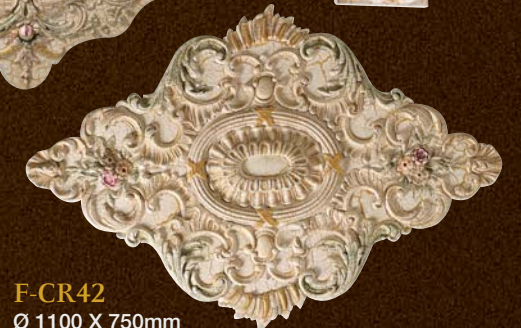
F-CR42 Ø 1100 X 750mm