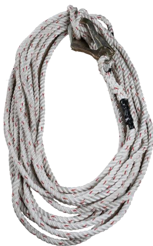
20 meters Lifeline