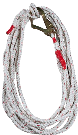
10 meters Lifeline