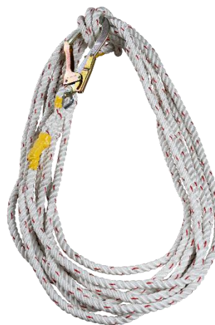
15 meters Lifeline