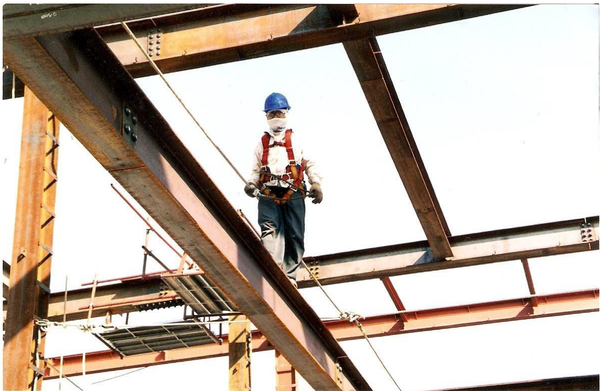
P.J.TEM Lifeline in-use