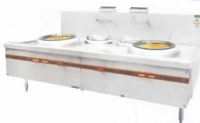
Chinese Cooking Stoves (GuangDong Style)

Model : ET-ZCY2-52/104H2 W2150xD1150xH1250mm Volt:220V/50Hz Power:0.55KW Power:354,862BTU/hr N/W:500 kg