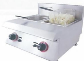
Counter Top Gas Fryer Model : ET-TGF-60 W595xD612xH480mm Power:38,400BTU/hr Capacity:11L N/W:31kg