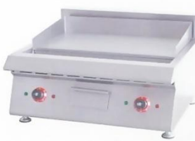
Counter Top Electric Griddle Model : ET-TEG-60 W600xD650xH400mm Volt:220V/50Hz Power:5KW N/W:42kg