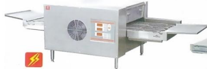
Electric Conveyor Pizza Oven Model: ET-HX-1SA W1460xD580xH435mm Working Area:W560xD385mm Volt:380V/50Hz Power:6.7KW N/W:49kg