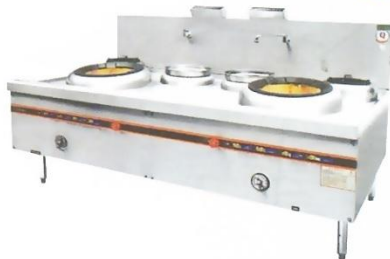
Chinese Cooking Stoves (ShangHai Style)

Model : ET-ZCY1-52/52H1 W1400xD1150xH1250mm Volt:220V/50Hz Power:0.37KW Power:177,431BTU/hr N/W:270 kg