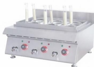
Counter Top Electric Noodle Cooker Model : ET-TEN-60 W600xD600xH400mm Volt:220V/50Hz Power:6KW N/W:25kg