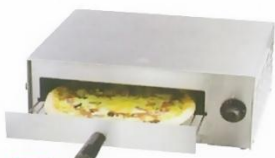
Electric Pizza Oven Model: ET-DBS-01 W460xD380xH170mm Baking Chamber:W335xD325xH57mm Volt:220V/50Hz Power:1.45KW