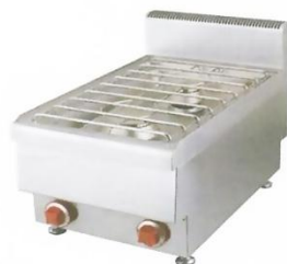
Counter Top Gas Stove (2-Burners) Model : ET-JUS-TR-2 W400xW650xH335mm+140mm Power : 27,295BTU/hr N/W : 22kg