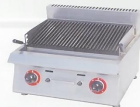
Counter Top Gas Lava Rock Grill Model : ET-TGB-60 W630xD612xH520mm Power:54,800BTU/hr Grill Zone:W570xD350mm N/W:46kg