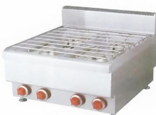
Counter Top Gas Stove (4-Burners) Model : ET-JUS-TR-4 W600xD650xH335mm+140mm Power : 54,590BTU/hr N/W : 30kg