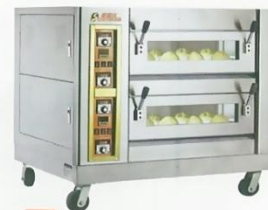
Electric Pizza Oven Model: ET-YXD-4P W1100xD850xH1300mm Inside:W660xD660xH180mm Volt:380V/50Hz Power:8KW N/W:210kg