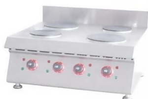
Counter Top Electric Cooker Model : ET-TEC-60 W600xD600xH400mm Volt:220V/50Hz Power:6.6KW N/W:22kg