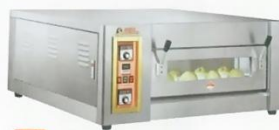
Electric Pizza Oven Model: ET-YXD-2P W1100xD850xH520mm Inside:W660xD660xH180mm Volt:380V/50Hz Power:4KW N/W:120kg