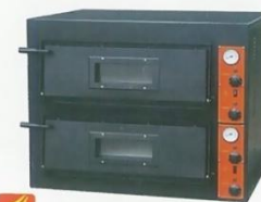
Electric Pizza Oven Model: ET-TEP-4-2A W910xD820xH750mm Inside:W610xD610xH150mm Volt:380V/50Hz Power:8.4KW N/W:130kg