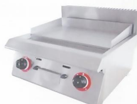
Counter Top Gas Griddle Model : ET-TGG-60 W600xD612xH520mm Power:54,800BTU/hr Grill Zone:W570xD350mm N/W:46kg