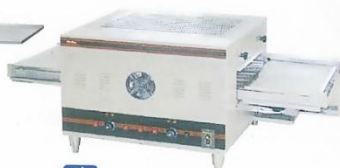
Gas Pizza Oven Model: ET-WCR-18 W1600xD770xH550mm Volt:220V/50Hz Power:0.06KW Power:22,520BTU/hr