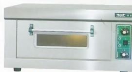
Electric Oven Model: ET-DFL-01C W720xD700xH450mm Volt:220V/50Hz Power:3.2KW N/W:32kg

Model:ET-ZXY20-A (2 Door 24 Tray) W1400xD645xH1570mm Power(KW/BTU):20/68,243 N/W:220kg