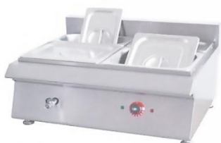
Counter Top Electric Bain Marie Model : ET-TEM-60 W700xD600xH400mm Volt:220V/50Hz Power:1.5KW N/W:24kg