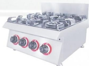
Counter Top Gas Stove 4-Burners Model : ET-TGS-64 W575xD612xH520mm Power:87,600BTU/hr N/W:44kg