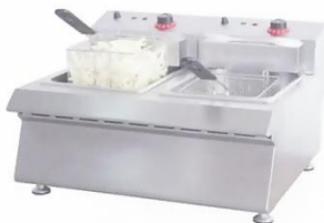
Counter Top Electric Fryer Model : ET-TEF-60 W600xD600xH400mm Volt:220V/50Hz Power:2.8+2.8KW Capacity:11L N/W:23kg