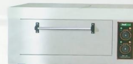
Electric Oven Model: ET-DFL-8B W750xD610xH450mm Volt:220V/50Hz Power:3.2KW N/W:30kg