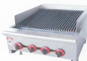
Gas Char Broiler (2 Burner) Model : ET-QR-14 W356xD770xH360mm+100mm Power : 50,000BTU/hr N/W : 56kg