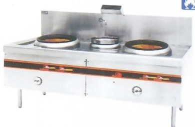
Chinese Cooking Stoves (GuangDong Style)

Model : ET-ZCY2-52/104G2 W2150xD1150xH1250mm Volt:220V/50Hz Power:0.55KW Power:354,862BTU/hr