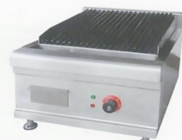
Counter Top Electric Lava Rock Grill Model : ET-TEB-19 W600xD470xH370mm Volt:220V/50Hz Power:4KW N/W:20kg