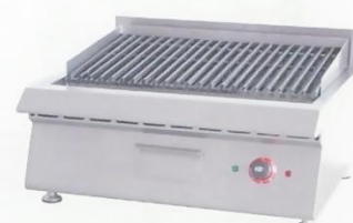
Counter Top Electric Lava Rock Grill Model : ET-TEB-60 W600xD600xH400mm Volt:220V/50Hz Power:7.2KW N/W:38kg