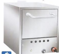
Gas Pizza Oven Model: ET-P019 W610xD670xH720mm Baking Chamber:W570xD500xH360mm Power:25,000BTU/hr N/W:73kg