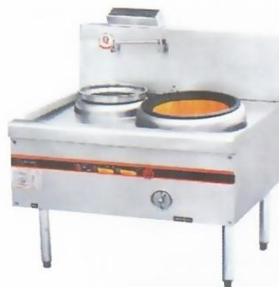
Chinese Cooking Stoves (GuangDong Style)

Model : ET-ZCY2-52/104Y2 W2000xD950xH1150mm Volt:220V/50Hz Power:0.55KW Power:354,862BTU/hr N/W:500 kg