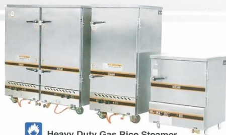
Heavy Duty Gas Rice Steamer

Model:ET-ZXY7-A (1 Door 7 Tray) W675xD645xH800mm Power(KW/BTU):7/23,885 N/W:84kg