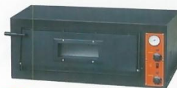
Electric Pizza Oven Model: ET-TEP-4-1A W910xD820xH430mm Inside:W610xD610xH140mm Volt:380V/50Hz Power:4.2KW N/W:60kg