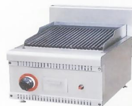
Counter Top Gas Lava Rock Grill Model : ET-TGB-19 W600xD470xH370mm Power:27,300BTU/hr N/W:20kg