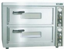
Stainless Steel Electric Pizza Oven Model: ET-DBS-2C W920xD765xH840mm Inside:W610xD610xH150mm Volt:380V/50Hz Power:8.4KW N/W:130kg