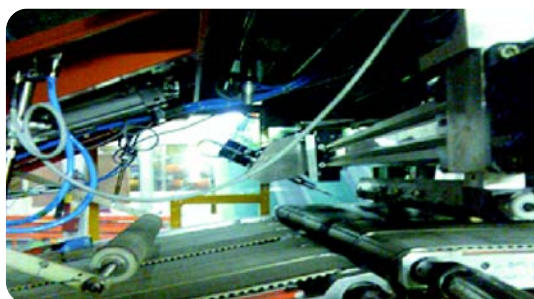
Tyre Slitting Machine