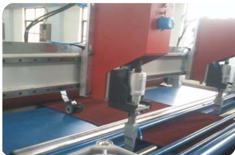
Automated Carpet Cutting and Sealing Machine