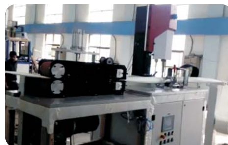
Geo-Drain Sealing Machine