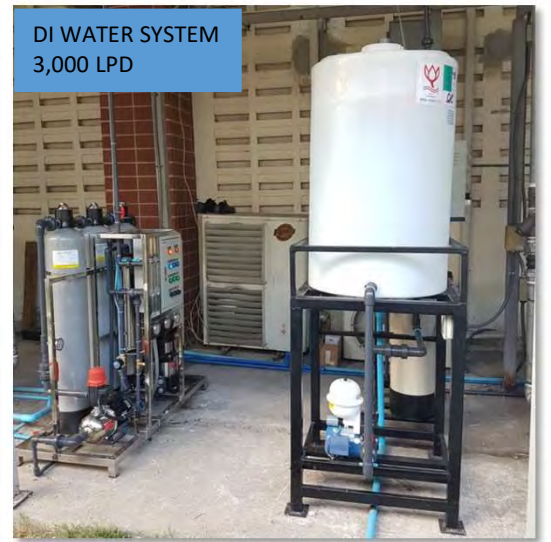
DI WATER SYSTEM 3,000 LPD