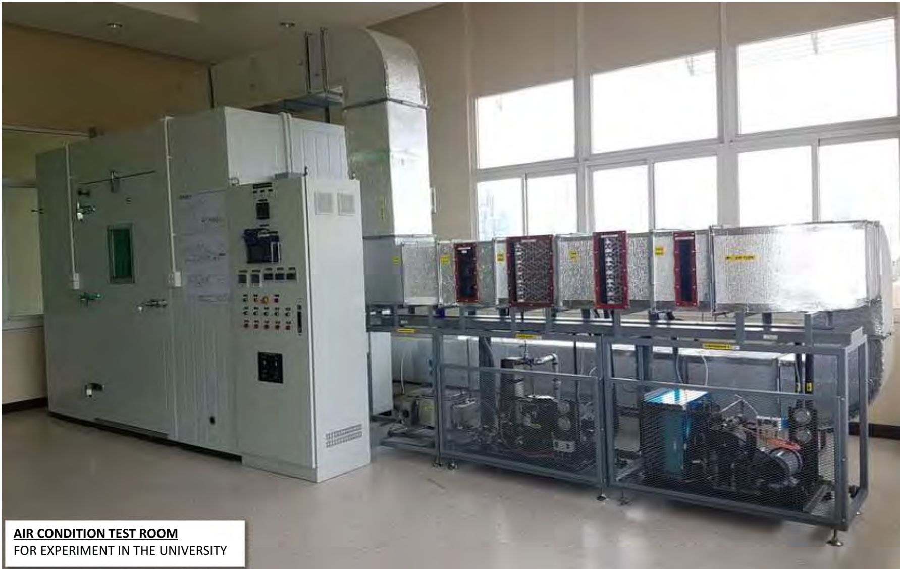
AIR CONDITION TEST ROOM FOR EXPERIMENT IN THE UNIVERSITY