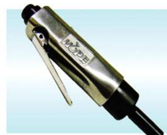
Smart eraser (KIT W/handle&rubber)