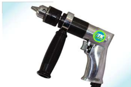
▶ KL-304 1/2" Air Drill reversible