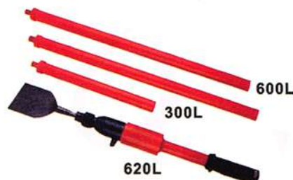
MSW-130/3LR-6LR Flux chipper Chisel Width : 100 x 70 x 50 x 40mm