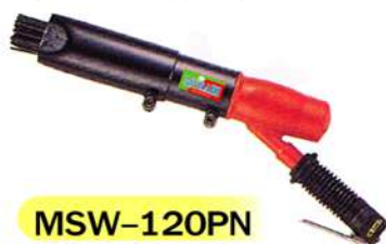
MSW-120PN Needle scaler professional Available Match : (2mm x 66pcs /; 3mm x 49pcs)