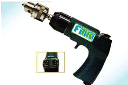
▶ MUW-8P Air Drill & Air Fast Tapping Tools