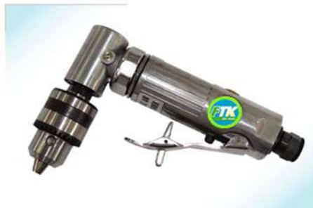
▶ KL-204GC 3/8" Air Drill 90