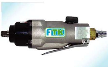
▶ MUB-810 3/8" Air WRENCH