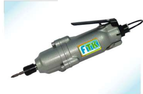
▶ MUS-976 Air Screw Driver