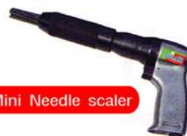
MSW-90 MPN Mini Needle scaler