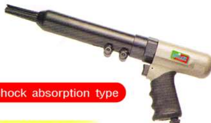
MSW-840/860/870 Needle scaler shock absorption type