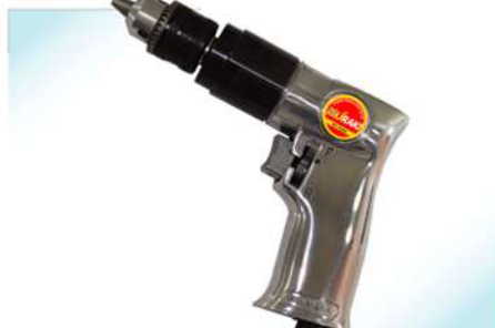
▶ KL-302 3/8" Air Drill reversible