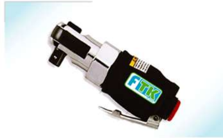
▶ MUW-1921 3/8" Air Impact