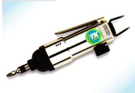
▶ MUS-905X Air Screw Driver