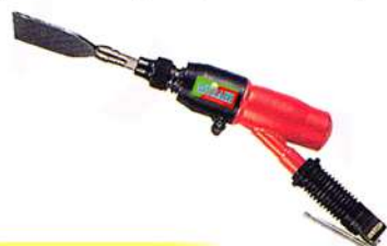
MSW-28BP Flux chipper