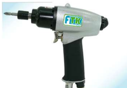
▶ MUS-810 Air Screwdriver-Angle Type