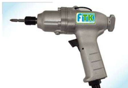
▶ MUS-926 Air Screw Driver