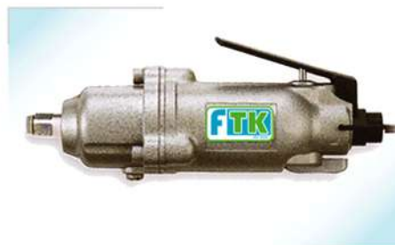
▶ MUB-380 3/8" Air WRENCH