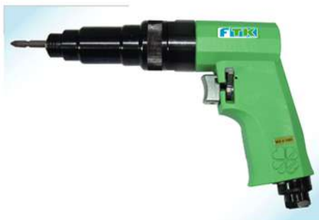
▶ PS-1E Air Screw Driver