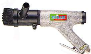
MSW-28PNA Needle scaler professional Available Match : (2mm x 66pcs /; 4mm x 14pcs)