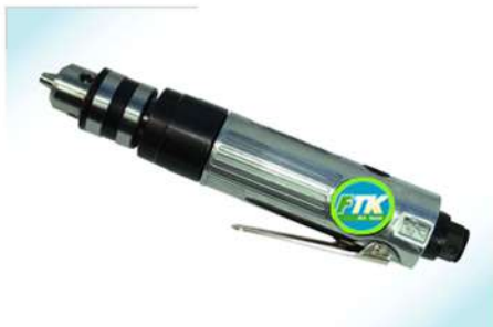
▶ MUW-215 3/8" Air Drill