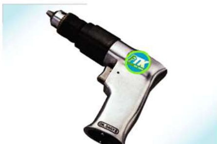
▶ KL-301 3/8" Air Drill reversible