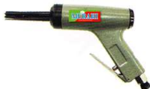
MSW-16PN Needle scaler professional