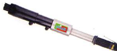
MSW-130F Needle scaler professional Available Match : (4mm x 19pcs)