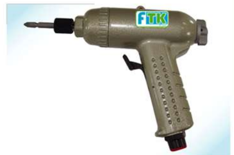
▶ MUS-306 Air Screw Driver