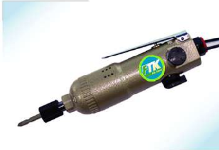
▶ MUS-905 Air Screw Driver