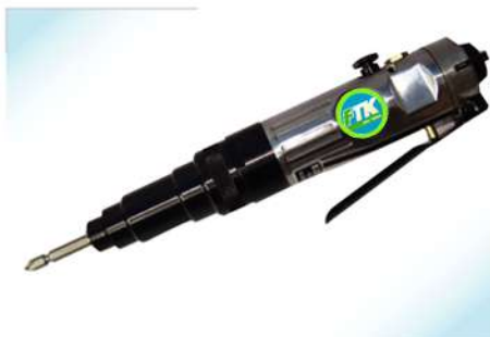
▶ MUS-924 Air Screw Driver