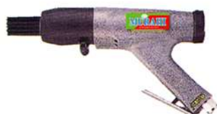
MSW-28PN Needle scaler professional Available Match : (2mm x 66pcs /; 4mm x 14pcs)