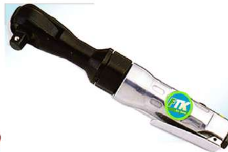
▶ MUB-730 1/2" Air Impact