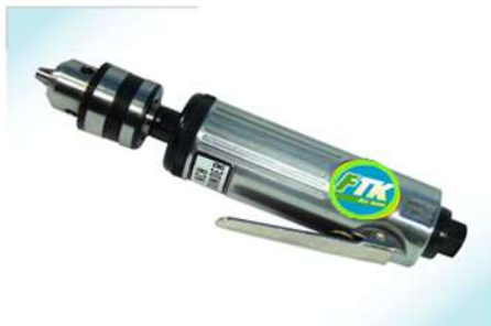
▶ MUW-815 3/8" Air Drill