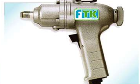
▶ MUB-860 3/8" Air WRENCH