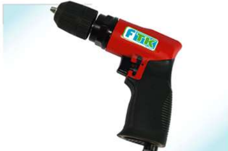
▶ MUW-213 3/8" Air Drill reversible