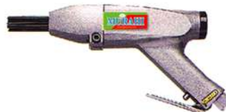
MSW-24PN Needle scaler professional