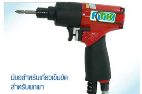
▶ MUS-512 Air Screwdriver-Angle Type