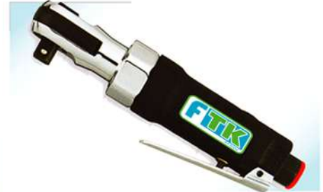
▶ MUW-729B 3/8" Air Impact