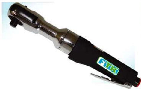
▶ MUB-734B 1/2" Air Impact