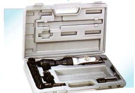
▶ MUB-730K 1/2" Air Impact