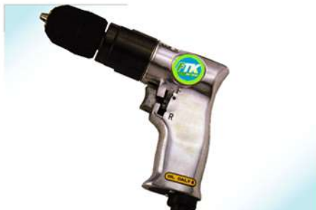
▶ MUW-659 3/8" Air Drill reversible